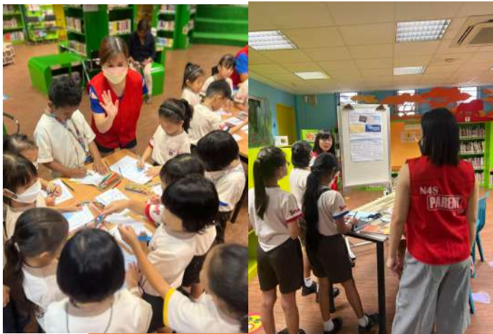
2023 World Water Day