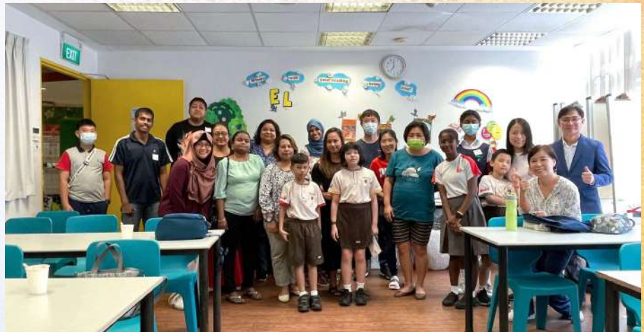
Let Us Chat