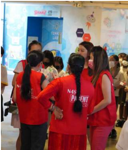
Teachers' Day planning