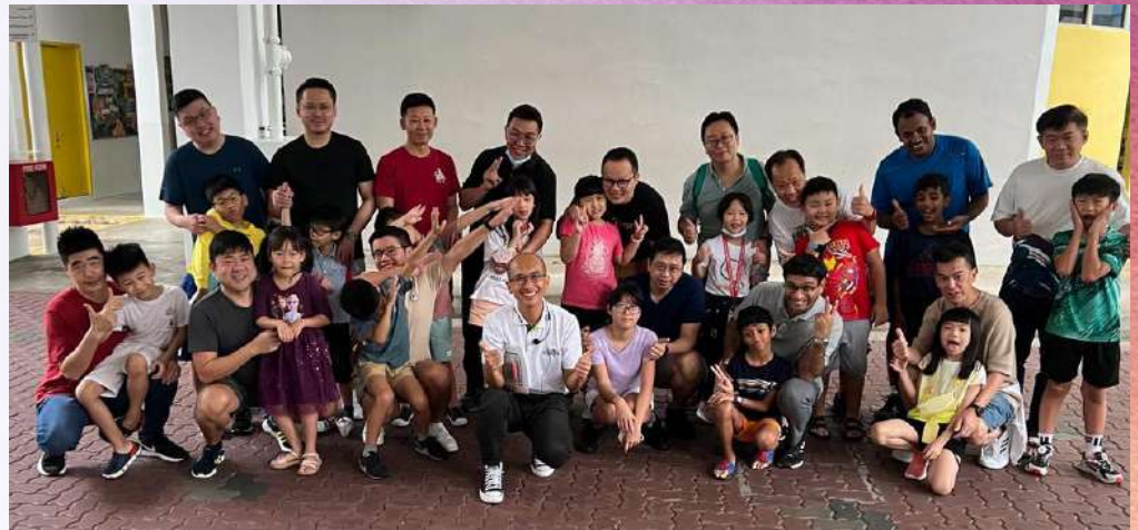
Dads for Life

(Centre for Fathering, Science Centre, COMPASS-MOE)