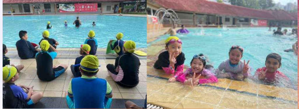
2023 Swimsafer Programme

(Recess activities, Learning journeys, School Programmes)