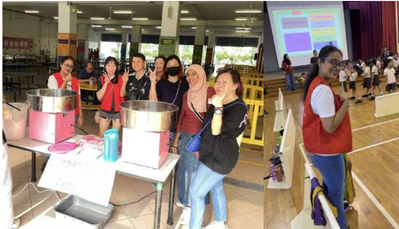
2023 Children's Day