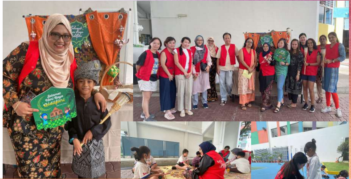
2023 Hari Raya recess activity