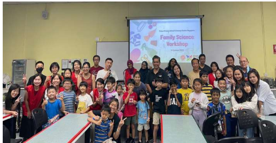
Family Science Programme