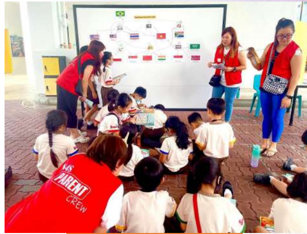
Total Defence Day