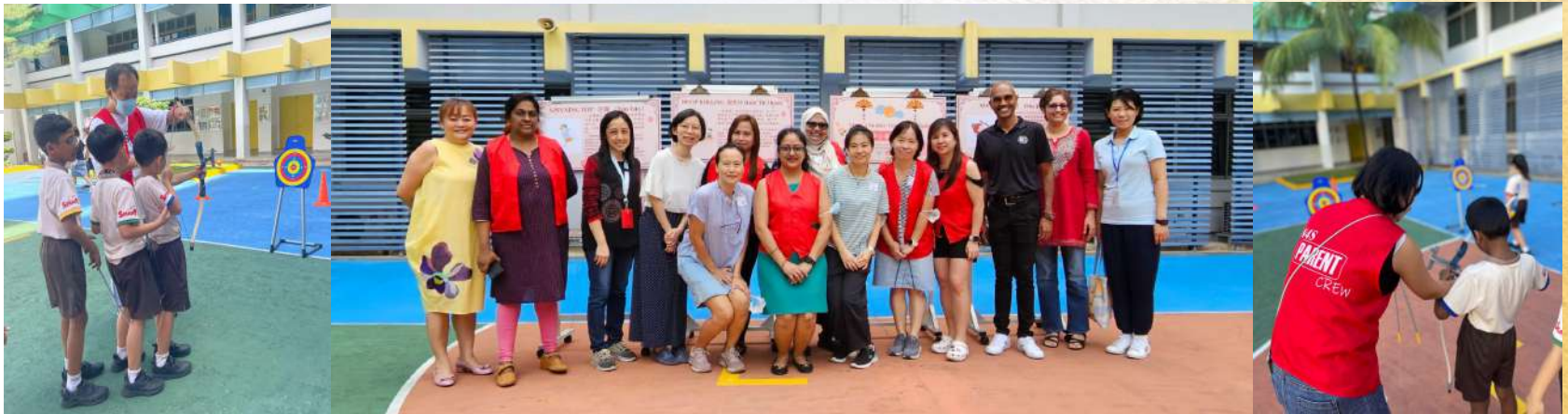
Mother Tongue Language Fortnight Activities