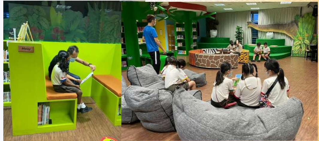
Paired reading & library PVs