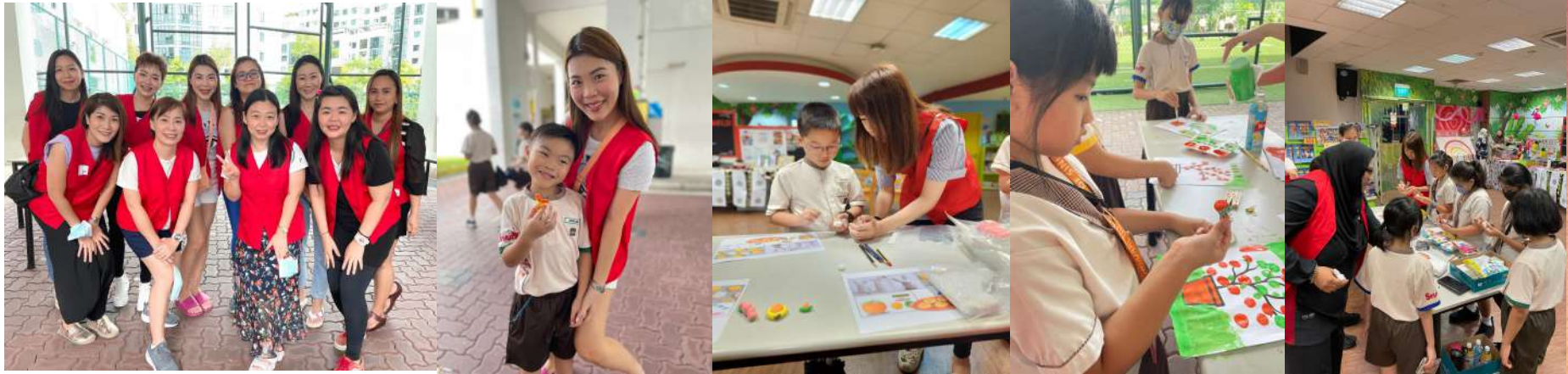
2023 Chinese New Year Recess Activity