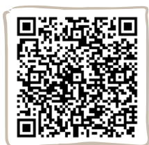
Useful resources for students

https://www.csa.gov.sg/Programmes/sq-cyber-safe-students/about-sq-cyber-safe-students