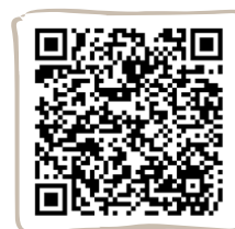
Visit Scam Alert website

https://www.csa.gov.sg/gosafeonline/Go-Safe-For-Me/For-Parents